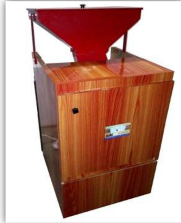
Model No: 003 B