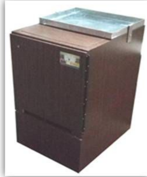
Model No: 004 B