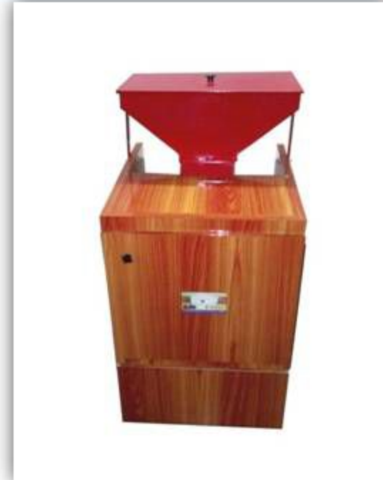
Model No: 003 A