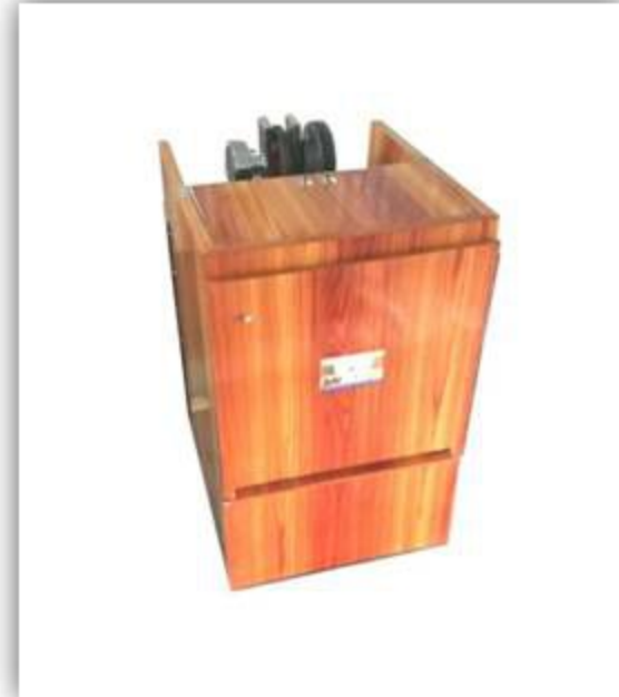
Model No: 004 A