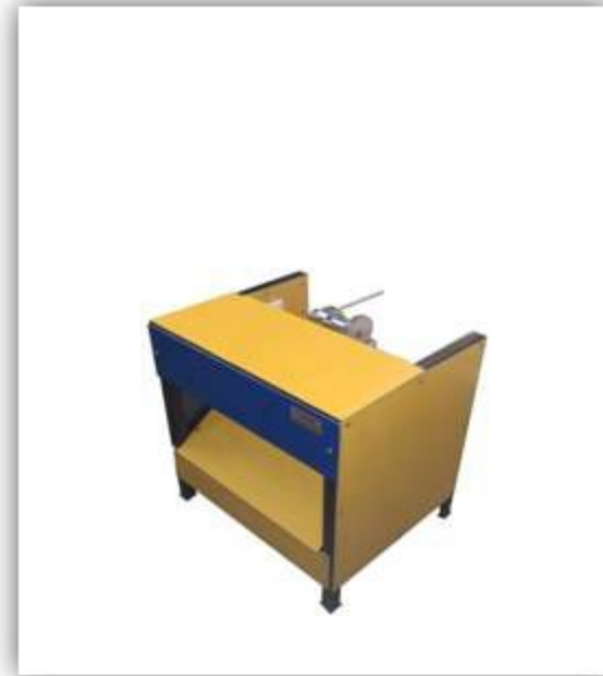
Model No: 002B